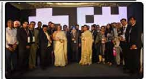
Some of the award winners